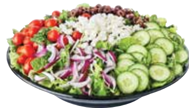
Colossal Greek Salad This Mediterranean-style salad is made with crisp romaine and iceberg lettuce, sliced cucumbers, grape tomatoes, red onions, black olives, crumbled feta cheese and Greek dressing. Serves 10.