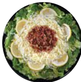
Caesar for a Crowd Inspired by tradition and prepared with fresh romaine lettuce, real bacon bits, Parmesan cheese, lemon wedges and creamy Caesar dressing. Serves 10.