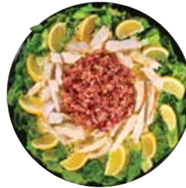
Chicken Caesar for a Crowd Made with romaine lettuce, shredded Parmesan cheese, real bacon bits, seasoned chicken breast slices, lemon wedges and Caesar dressing. Serves 10.