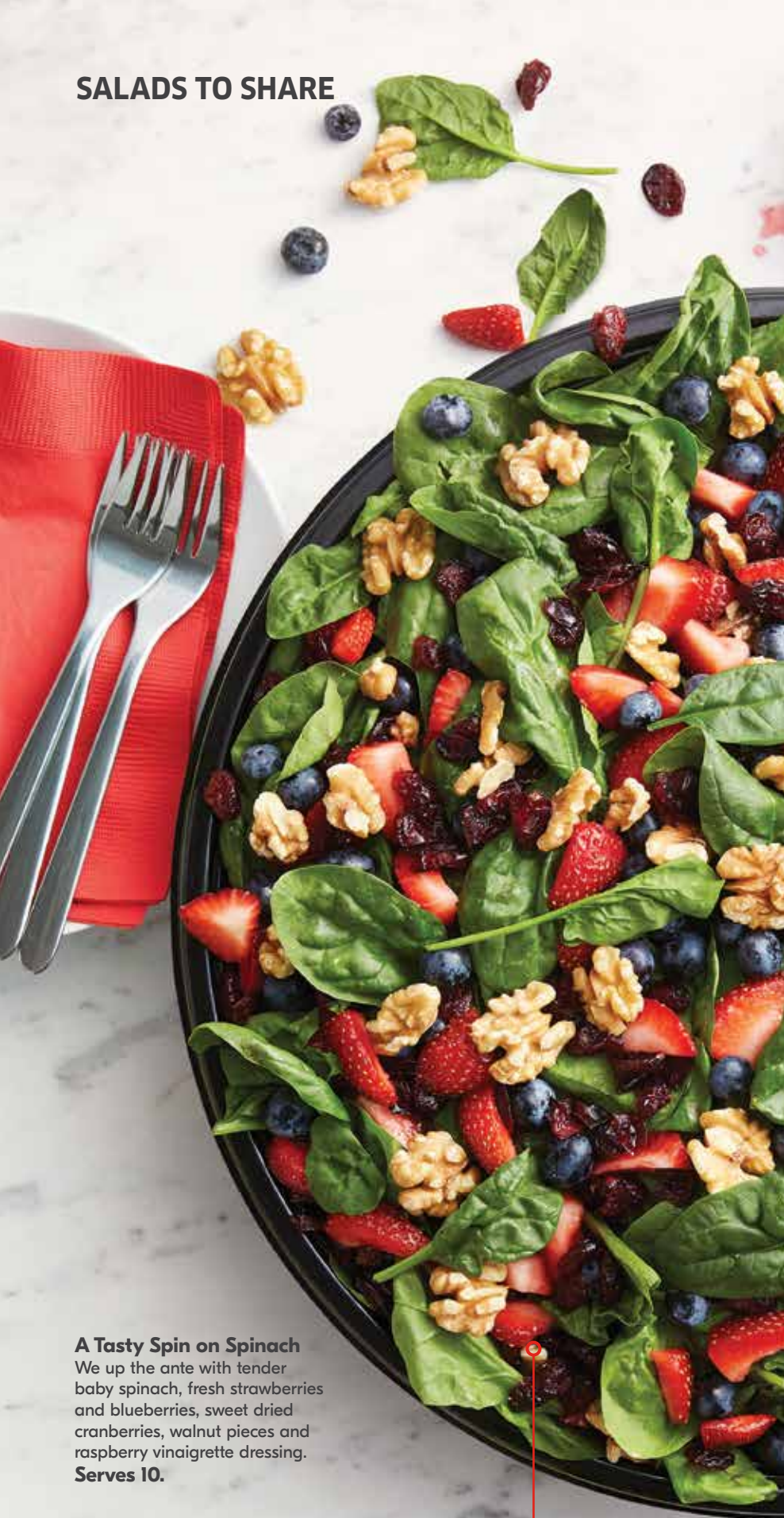
A Tasty Spin on Spinach We up the ante with tender baby spinach, fresh strawberries and blueberries, sweet dried cranberries, walnut pieces and raspberry vinaigrette dressing. Serves 10.

Fruit and nuts enhance the salad's flavours