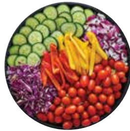
Gardener's Harvest Salad Romaine, spring mix and iceberg lettuce topped with cucumbers, grape tomatoes, red onions, red cabbage, sweet peppers and balsamic vinaigrette. Serves 10.

Fruit and nuts enhance the salad's flavours